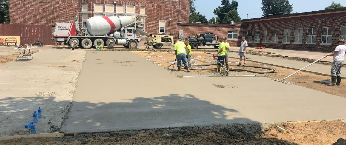
Update: 7/24/2019: The construction crew is prepping the area before pouring the concrete pad.