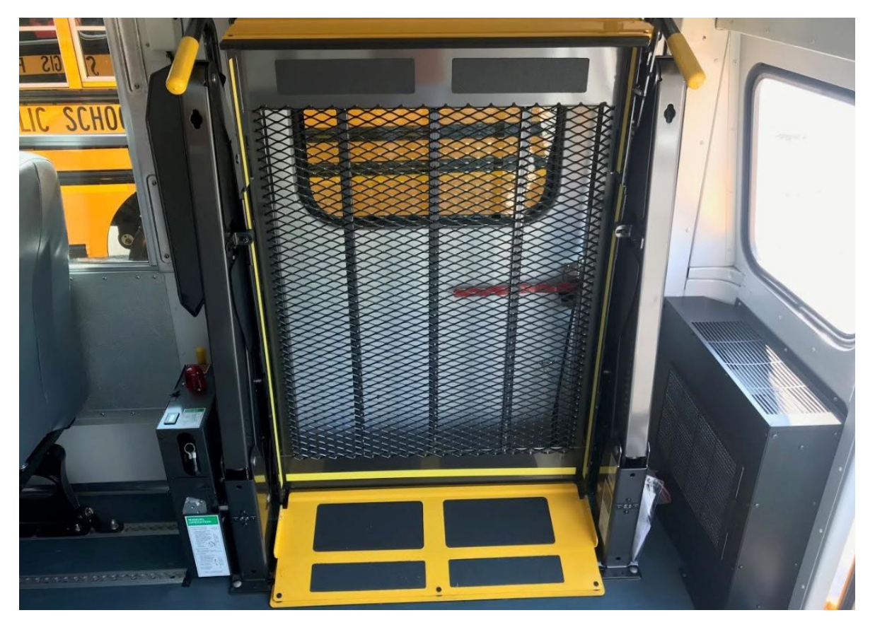
Interior picture of the lift on the new bus with the wheel chair lift and child seats.