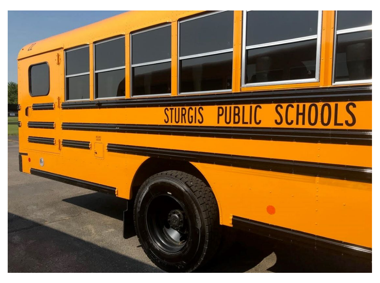
Exterior picture of the new bus with the wheel chair lift and child seats.