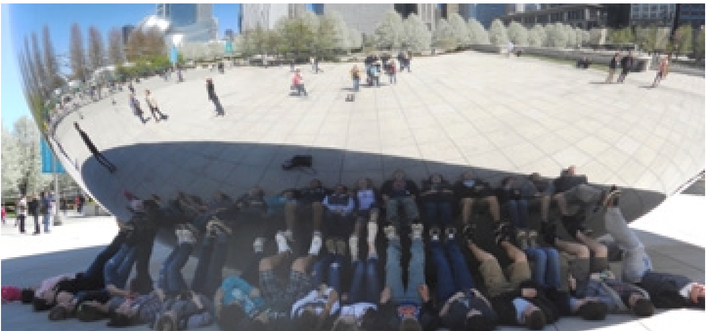
Painting II and Art Appreciation (a GOCC humanities dual enrollment class) students enjoy a break from museum hopping at Millennium Park. They are gently cooling their heels on Chicago's famous "Bean" sculpture by Anish Kapoor .