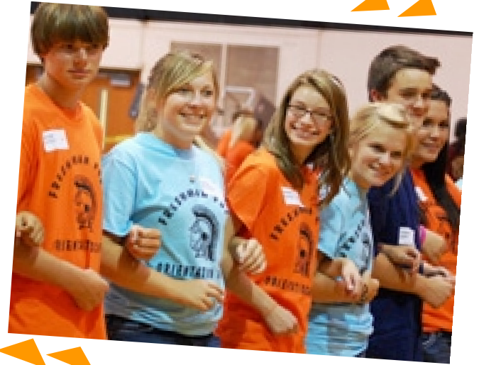
Freshman Focus was a fun way to introduce incoming freshman to the high school.