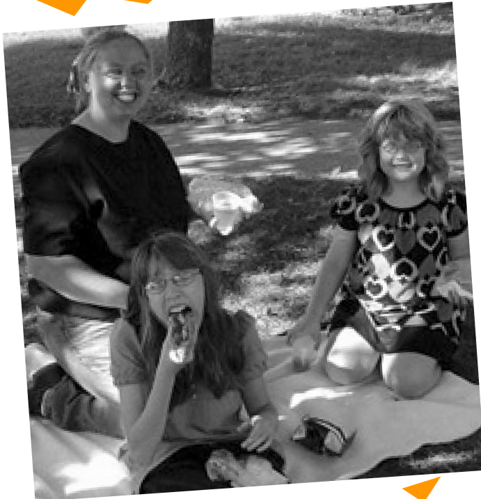
There was fun for everyone at last year's Wall School Tailgate party.

Other fun includes a book fair, balloons and ice-cream.