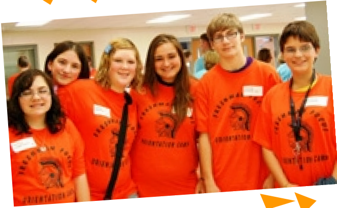
Sturgis High School recently hosted a Freshmen Focus Orientation camp for incoming freshman. The camp allowed students to get comfortable with each other and their new school building before school started.