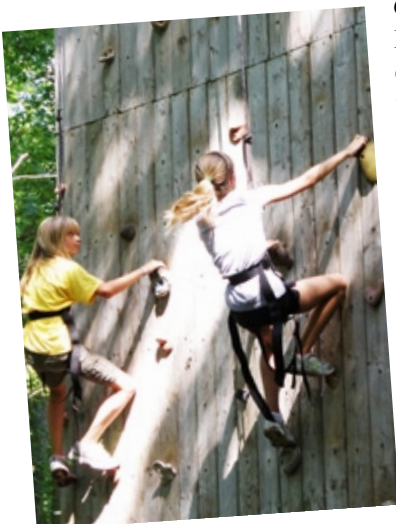
Climbing the wall at Camp Fort Hill Summer Camp.