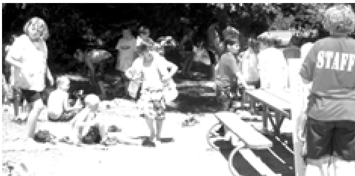
Beach time at Camp Fort Hill Day Camp.