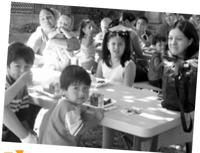
Children enjoy the free lunches provided by Sturgis Public Schools throughout the summer.