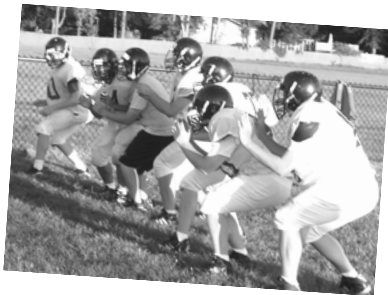
The Sturgis Football team gets ready for a new season.

Season athletic passes for the 2010-11 school year are now available for purchase. You may download the Pass form from the SPS website ( www.sturgisps.org ): select High School, Athletic, Athletic Home Page, Forms, Season Tickets or call the athletic office at 659-1535 for more information. An annual family pass is $175, a student/senior annual pass is $50, and a student/senior 10-game punch pass is $25. See you at the game!